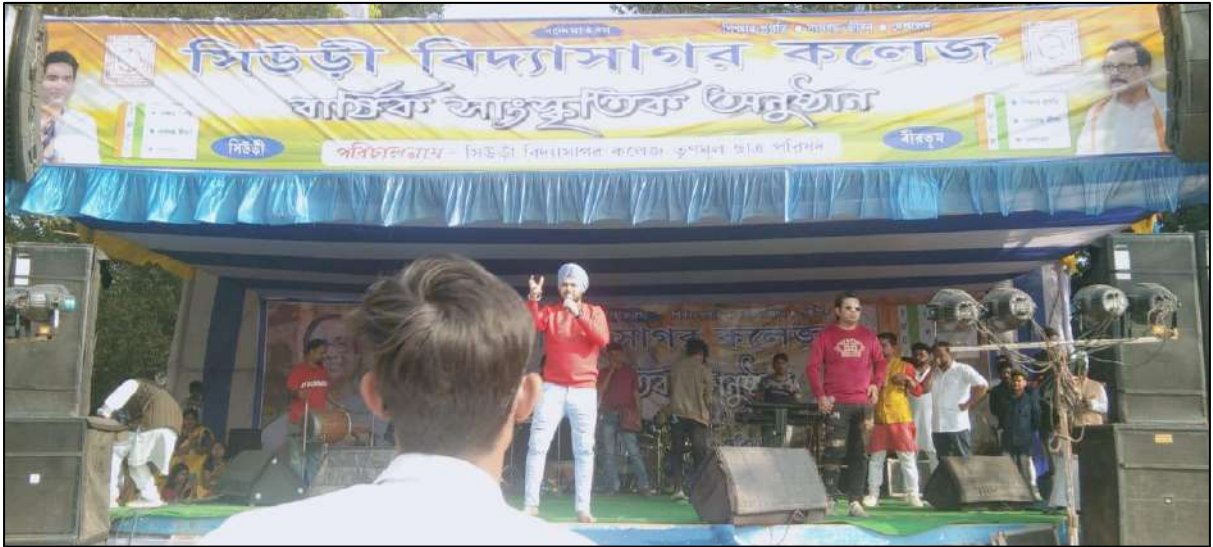
Performance of Singer Gurujit Singh