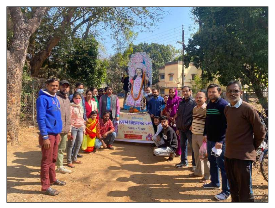
Before Procession of Pratima for Niranjan