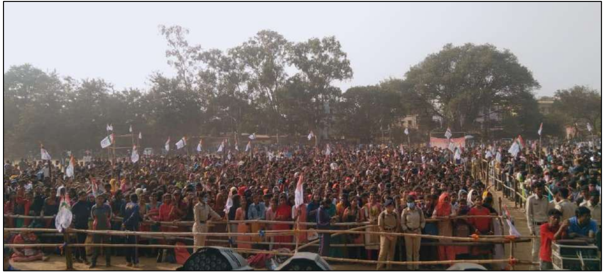
Students as Audience are protected by Police Force & NCC on the College Ground