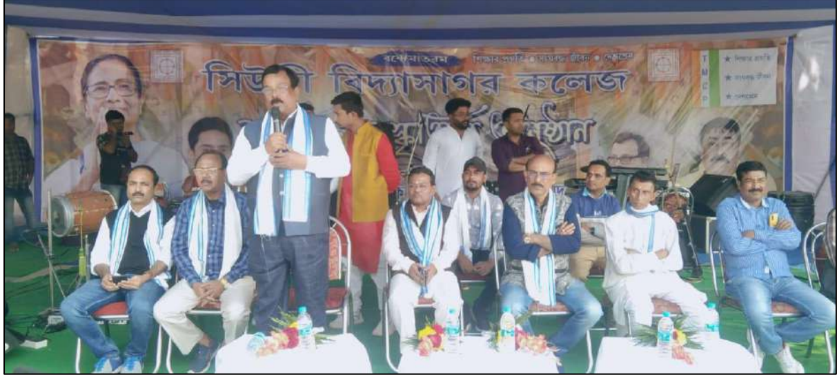
Speech is delivered by President sir in presence of guests and faculties on Dias