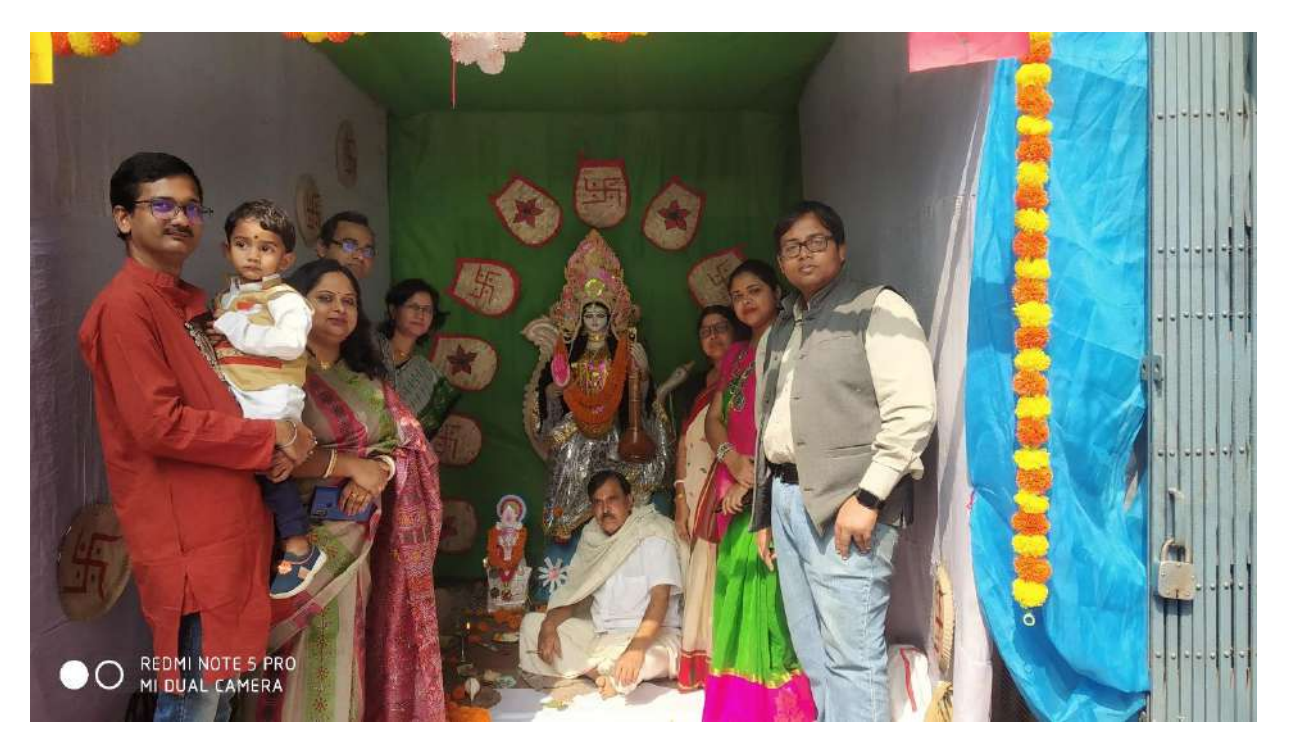
Teachers and Purohit after puja