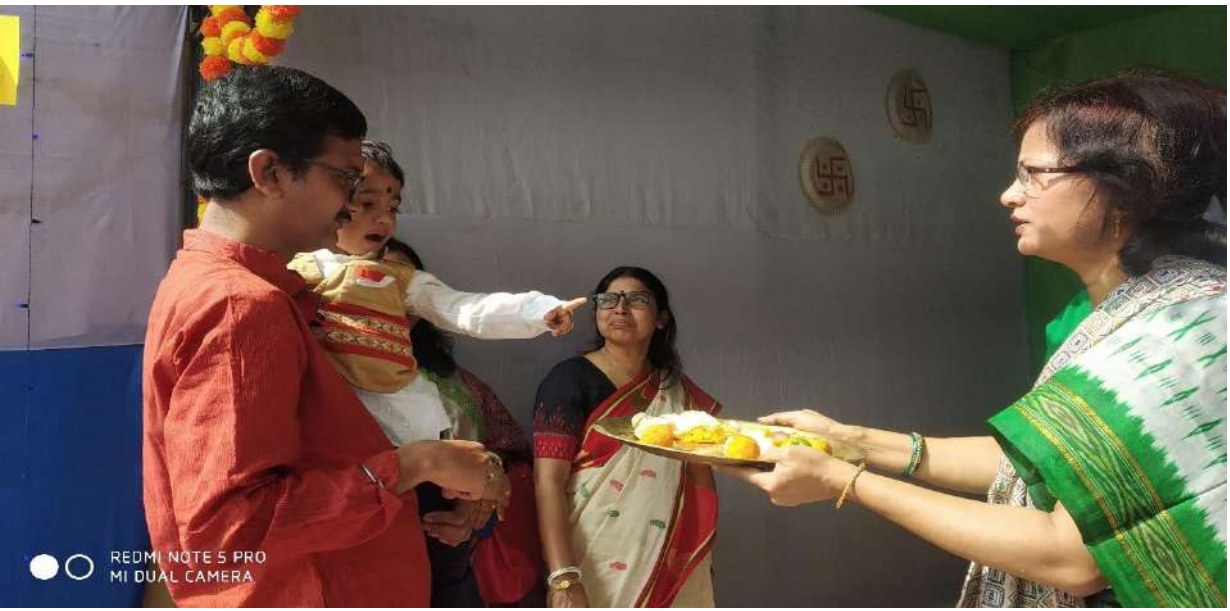
Distribution of Prasad by Madam