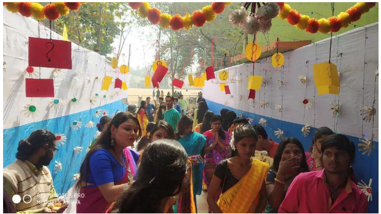
Students of Our College