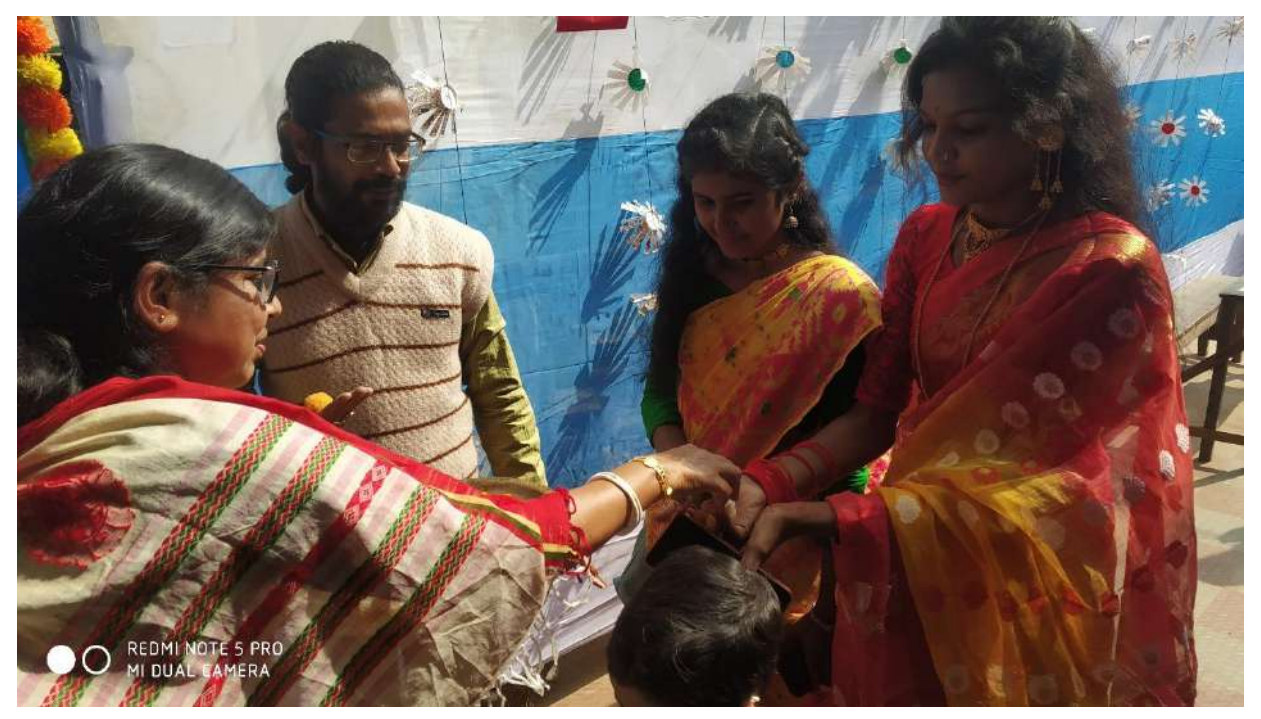
Distribution of Prasad by Madam