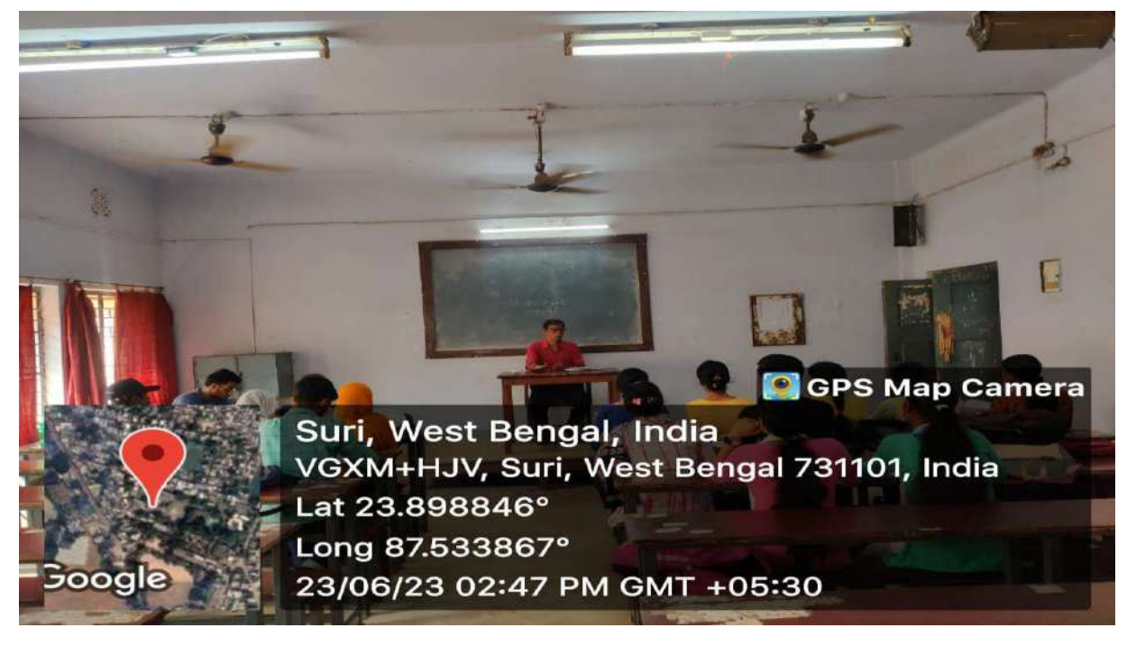
Dept. of History (Pic-2)

ACCREDITED BY NAAC-B** Affiliated to the University of Burdwan