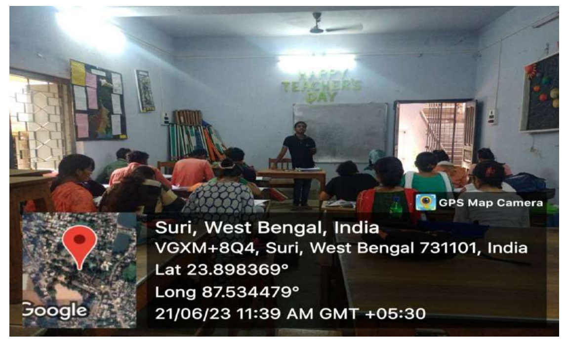
Geography Class room (Pic-1)

ACCREDITED BY NAAC-B** Affiliated to the University of Burdwan