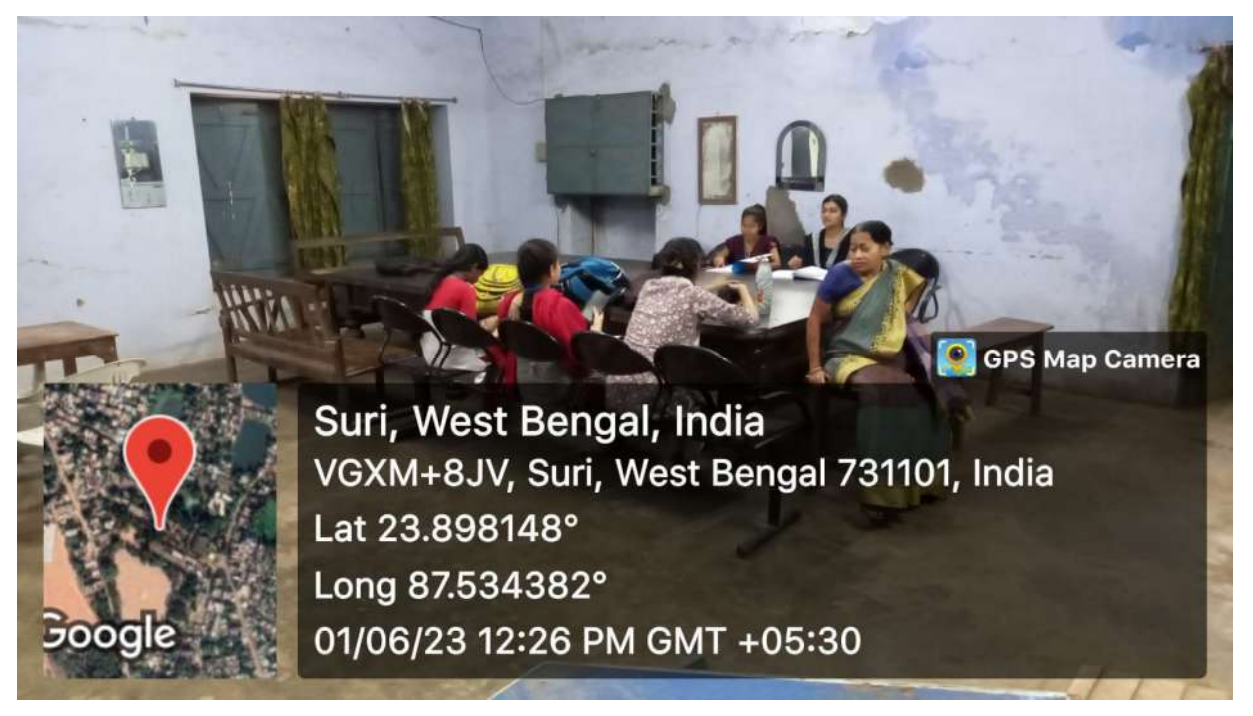
Girls' Common RoomPicture1

ACCREDITED BY NAAC-B** Affiliated to the University of Burdwan