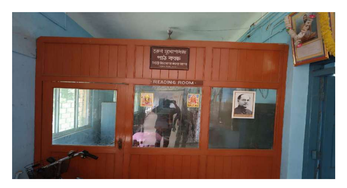
Library Reading room 1