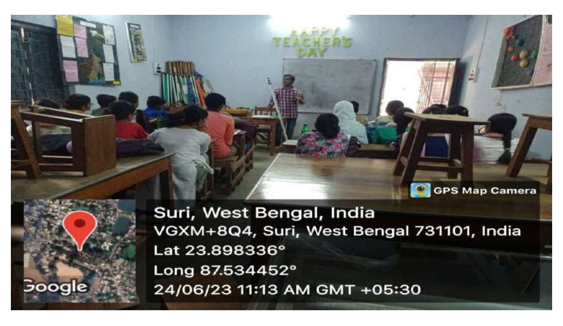
Geography Class room (Pic-2)