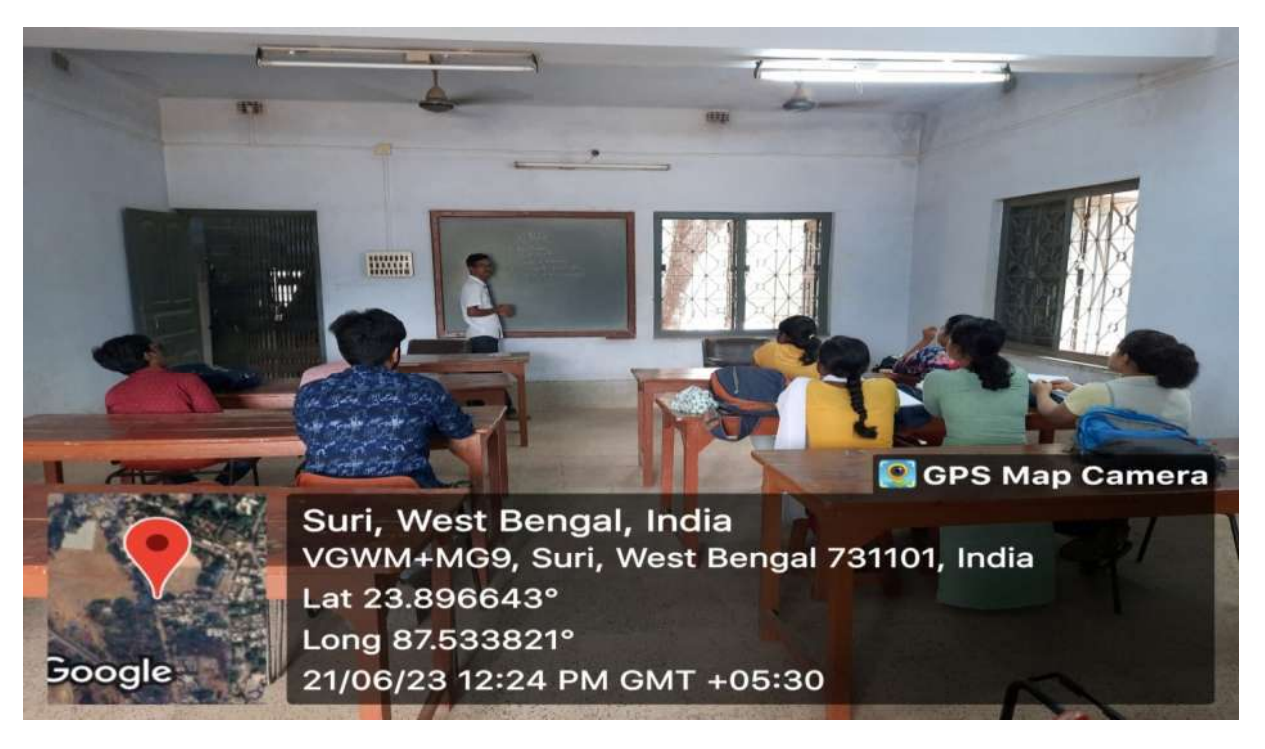
Dept. of Microbiology