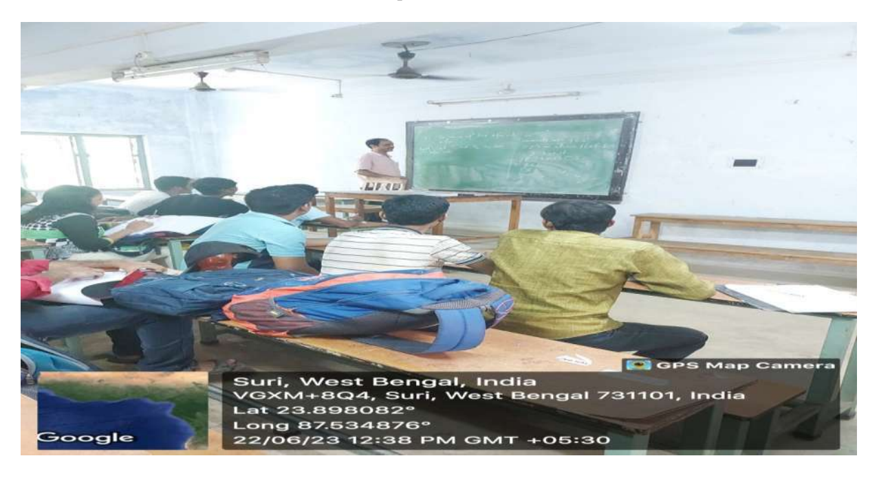
Dept. of Mathematics