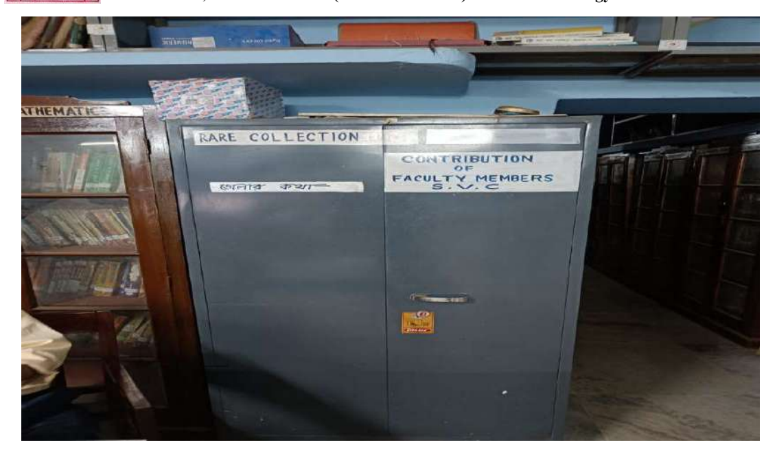
Rare collection 1

B. A., B. Sc.& B. Com. (Hons. & General)& M. Sc. in Zoology