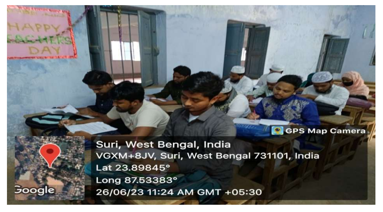
Dept. of Arabic

ACCREDITED BY NAAC-B** Affiliated to the University of Burdwan