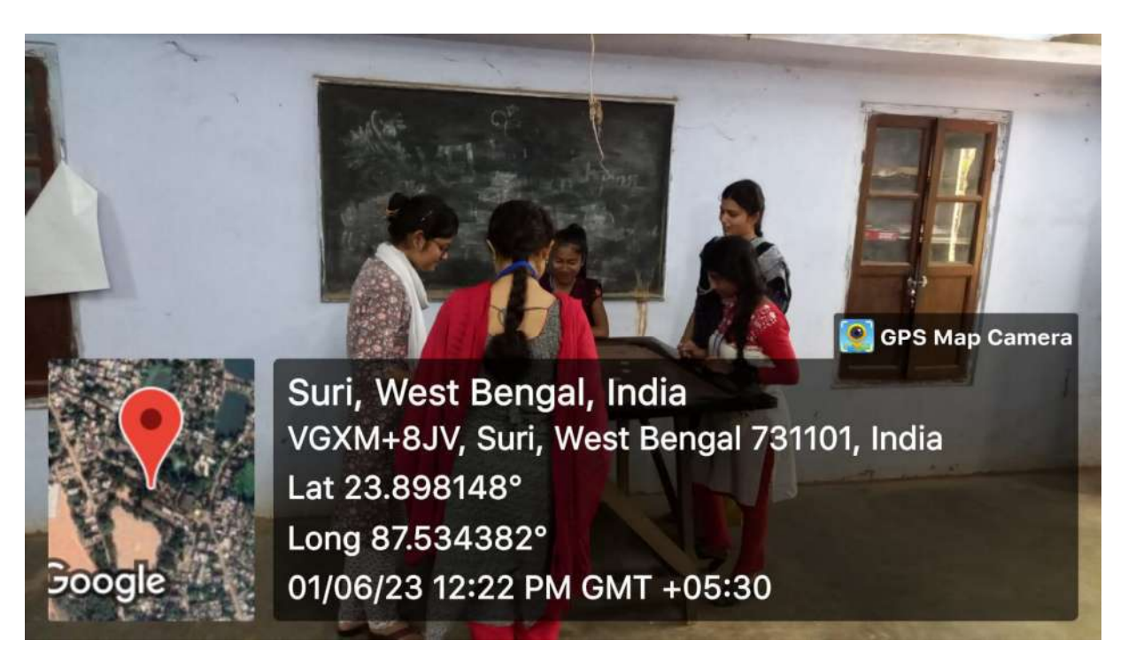
Girls' Common Room Picture 2