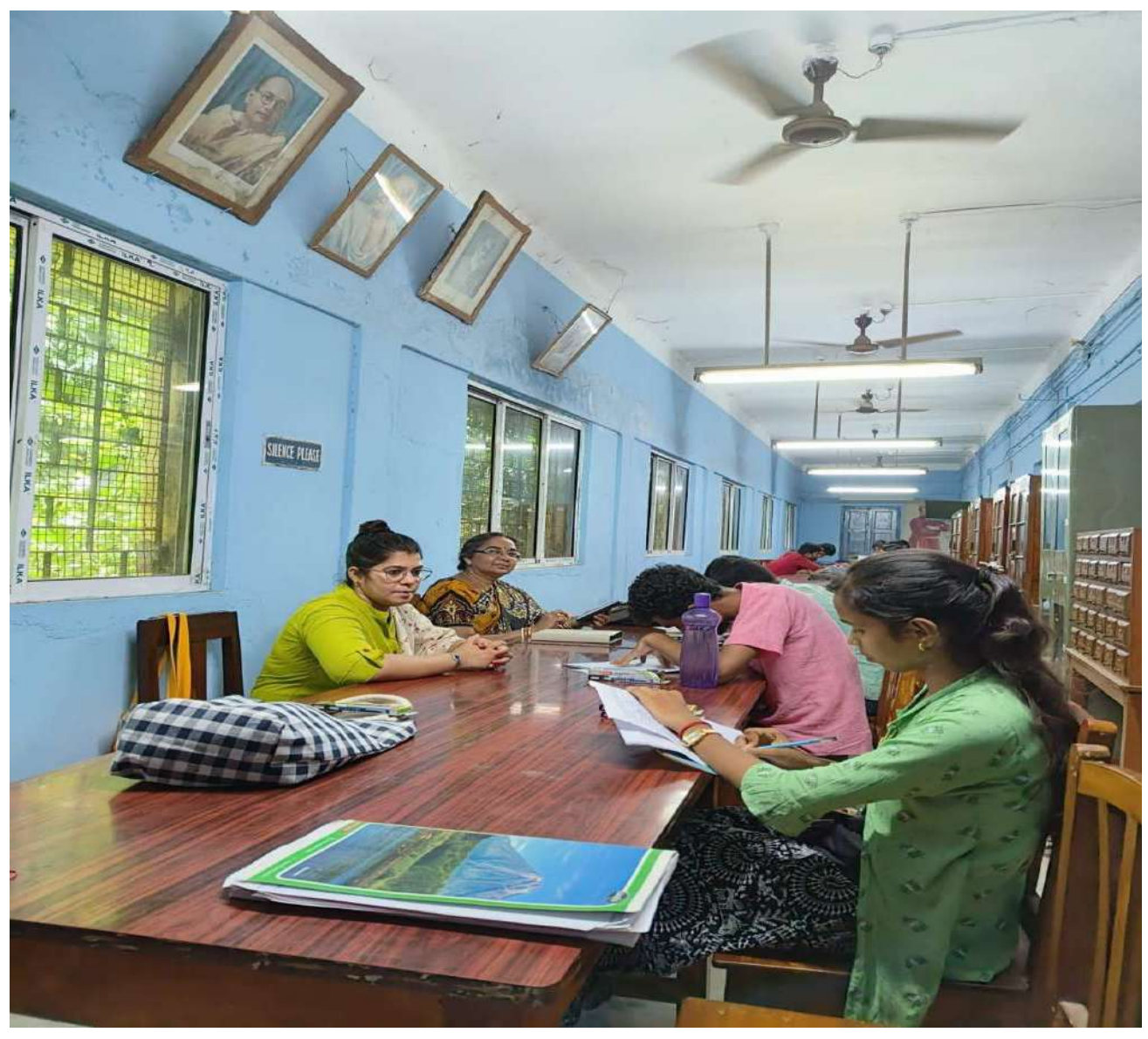
Library Reading room 2

B. A., B. Sc.& B. Com. (Hons. & General)& M. Sc. in Zoology