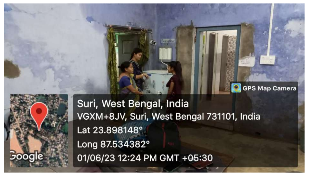
Drinking water picture 1

ACCREDITED BY NAAC-B** Affiliated to the University of Burdwan