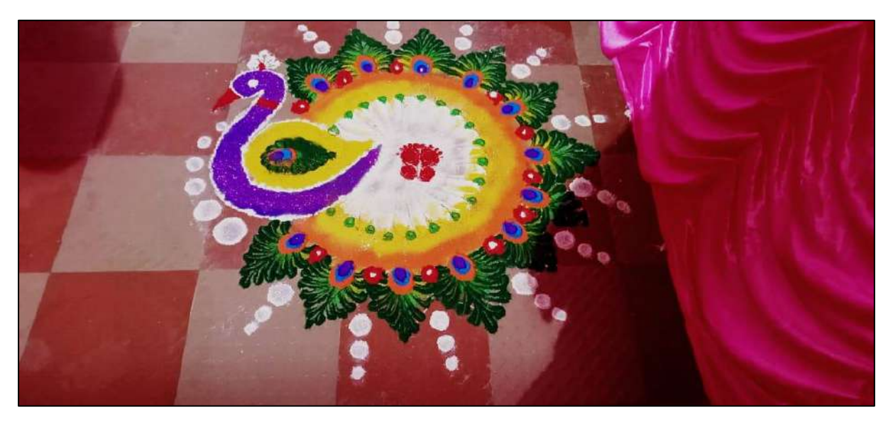
Rangoli drawn by the students of Suri Vidyasagar College