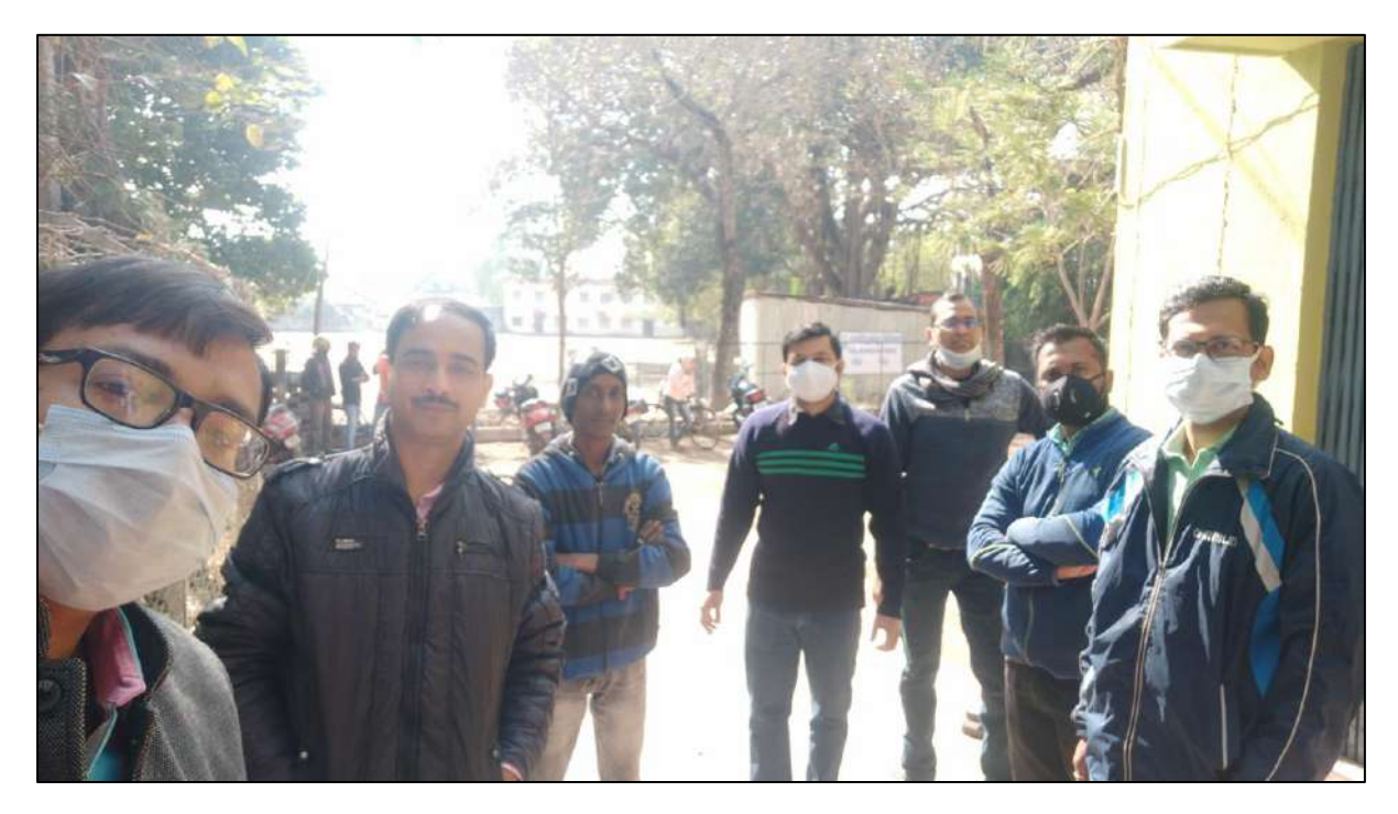
Teachers of this college adopting precaution against Covid as per as possible