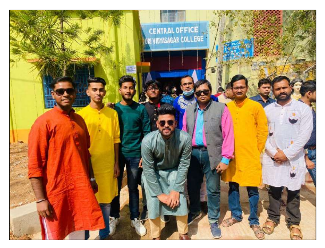
Enjoyment of students and Teachers After Puspanjali