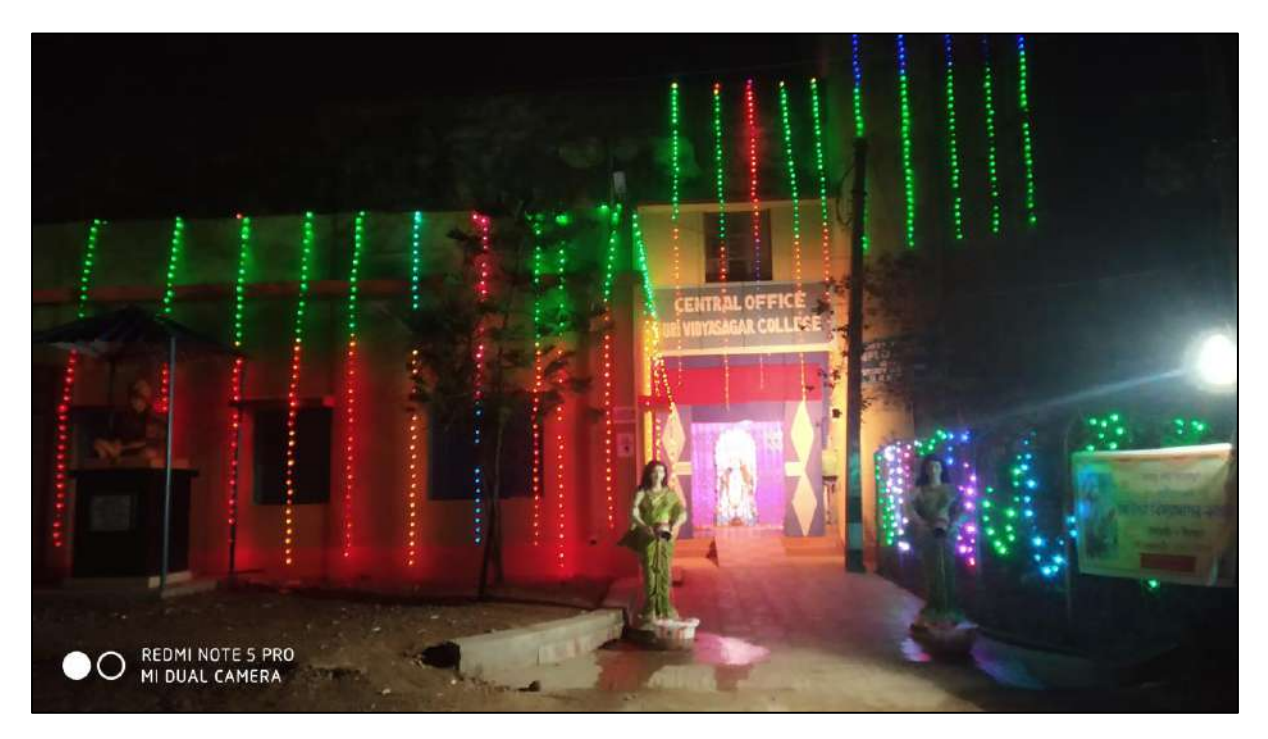
Lightening of campus by LED lamp in Saraswati puja eve