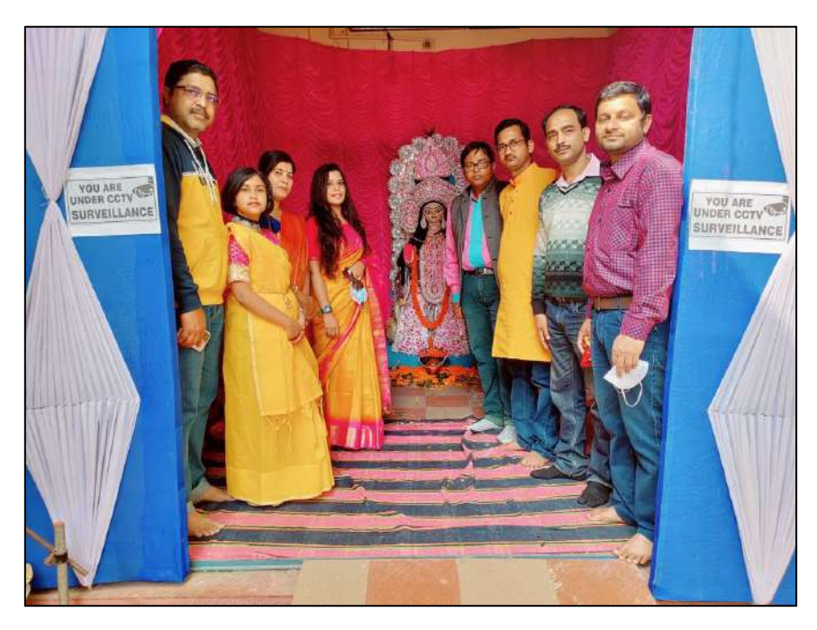
Actively participating Students with Teachers

Awareness poster against Covid beside the pandel for taking better precaution