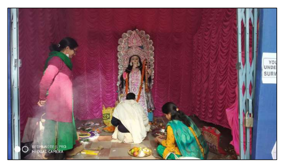
During Puja by Purohit