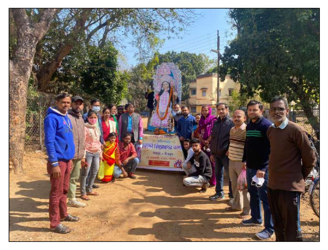
Before Procession of Pratima for Niranjan