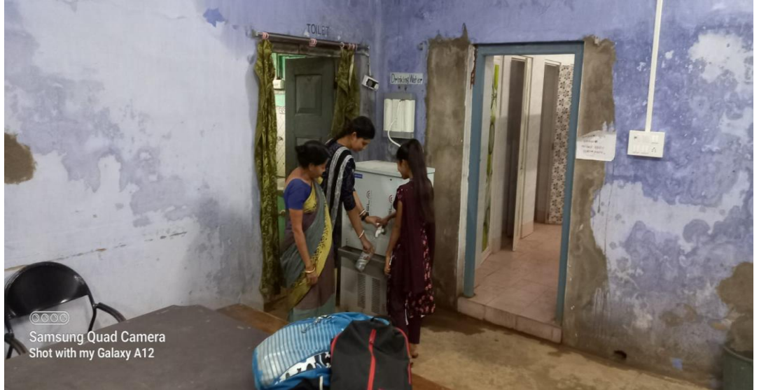
AMC maintained water purifier